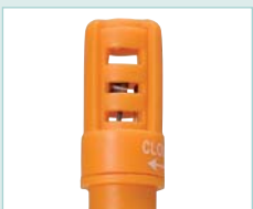
Unique sensor cap design Twist to open or close sensor for storage.