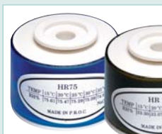
RH300-CAL Optional calibration salt bottles