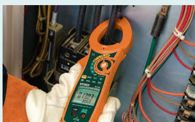
2.0" (52mm) jaw size for conductors up to 500MCM