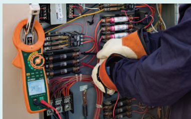
Test leads included for Multimeter functions