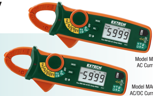
Model MA61 AC Current