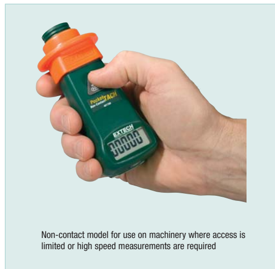
Non-contact model for use on machinery where access is limited or high speed measurements are required