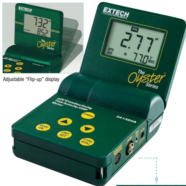
Adjustable “Flip-up” display