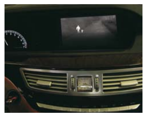
The thermal images generated by the PathFindIR can be displayed on any multi-function LCD display that accepts composite video. In this case on an LCD integrated in the Mercedes dashboard