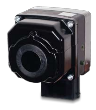
FLIR Systems PathFindIR can be easily integrated in all types of cars, busses and trucks.

"The feedback we are getting from the users of the PathFindlR is very positive. They tell us that the display on which the thermal image is projected quickly becomes a natural checkpoint for the driver just like side-view or rear-view mirrors. It helps them tremendously when driving at night but also in rain, fog and other harsh weather conditions."