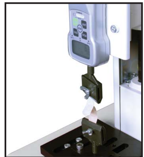
Stand with Optional Grip Performing Peel Test