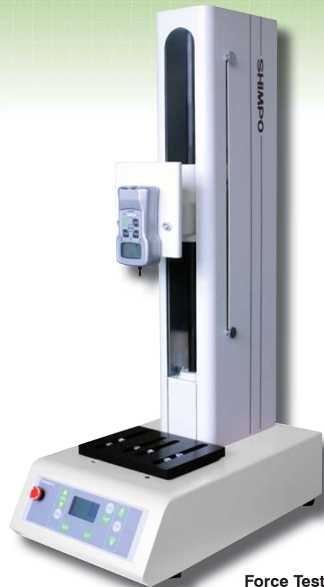
Force Test Stand shown with Force Gauge (Sold Separately)

The FGS-VC's can be equipped with various gripping and compression fixtures and are compatible with all Shimpo Force Gauges as well as most gauges on the market. These features make the new FGS-VC the ideal push/pull tester for the production line or QC lab.