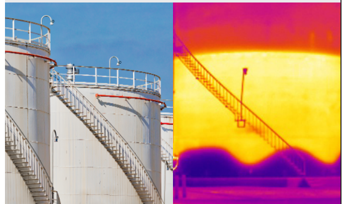
Thermal imaging technology can help oil and gas companies gauge tank levels without direct contact, as well as distinguish small changes in temperature between liquids or solids of varying densities and specific heat characteristics.