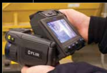
Rotating Optical Block