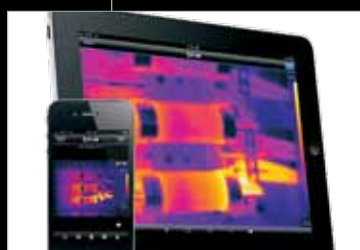
Connect to iPhone, iPad, or iPod touch via Wi-Fi