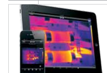
Connect to iPhone, iPad, or iPod touch via Wi-Fi