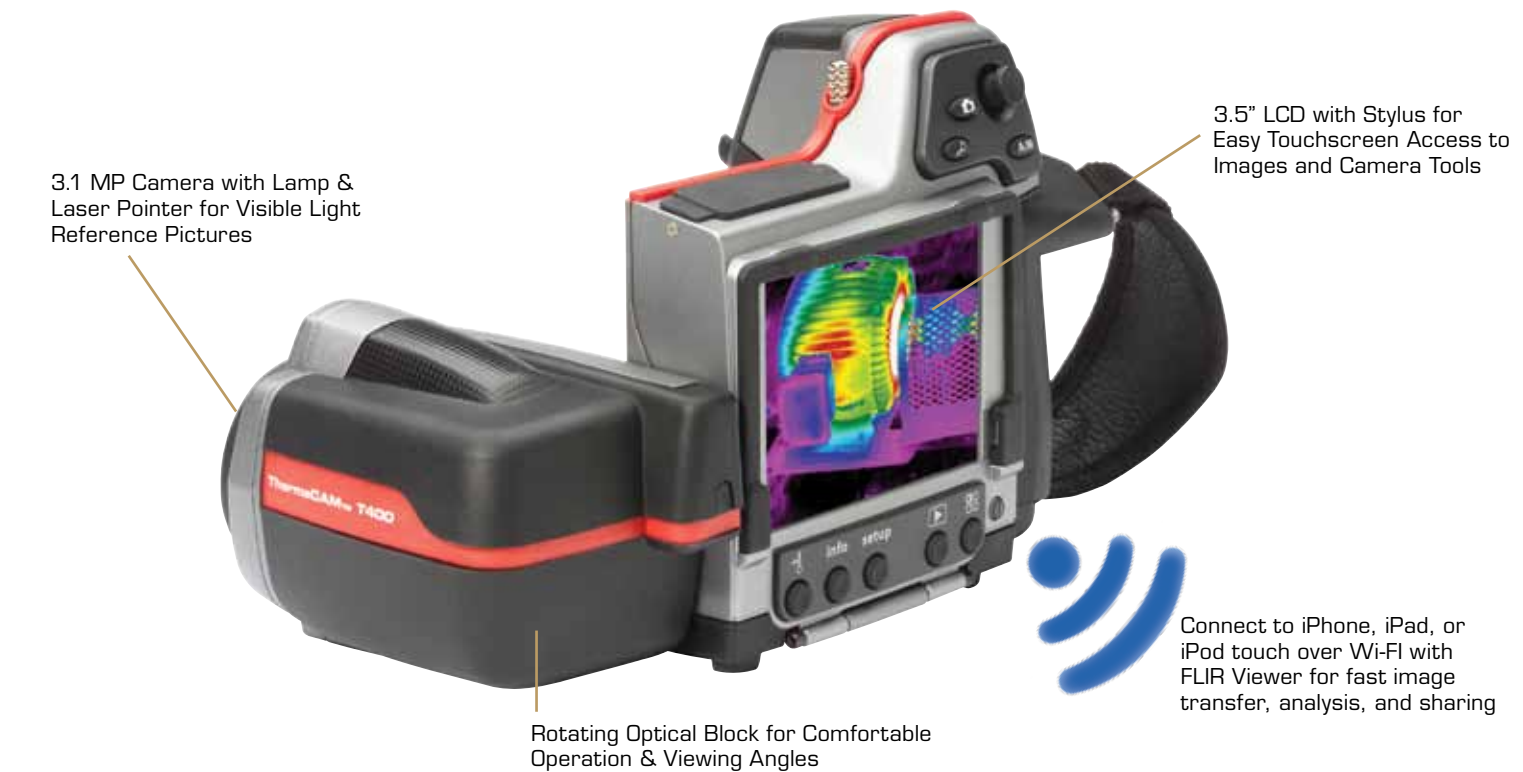
3.1 MP Camera with Lamp & Laser Pointer for Visible Light Reference Pictures