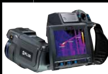
4.3" Touch-Screen LCD

Thermal Fusion and P-i-P – Blend thermal and visible light images onscreen and scale picture-in-picture overlays to identify targets and locations easily