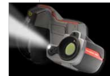
Digital Camera with Lamp