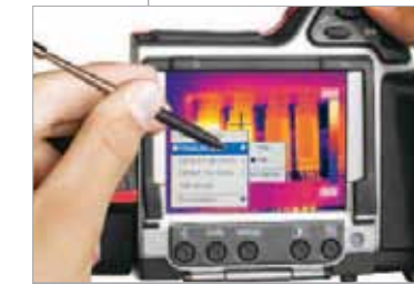
3.5" Touchscreen LCD

InstantReport – Generate a professional PDF document in the camera without an external computer and complete the job before you leave the site