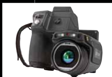
5 MP Digital Camera with Lamp