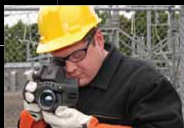
T640 Color Viewfinder