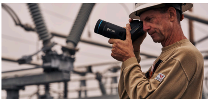
Assess the state of equipment from a safe distance, at any angle, or in any lighting condition