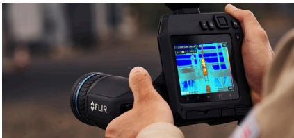
Collect and manage critical data quickly and easily