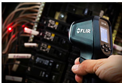
Easily identify measurement location with built-in laser