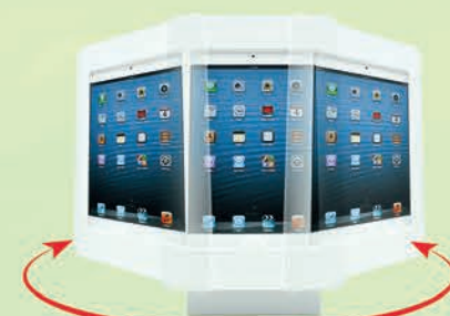
Enclosure can Swivel 90° Left and Right