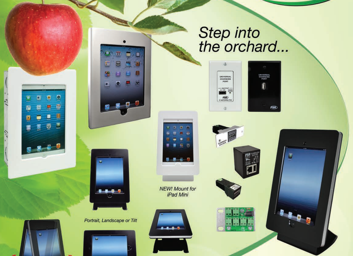
NEW! Mount for iPad Mini