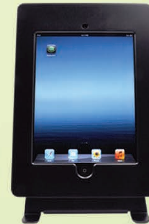
TM-IPD Portrait Position