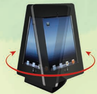
Swivel version Enclosure can Swivel 90° Left and Right