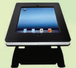
Enclosure can tilt from 15° to 60°