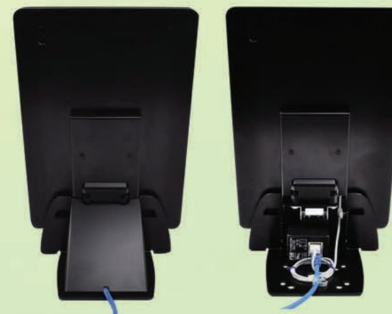
Enclosure Shown with Back Cover in Place and Open to show PoE to USB Charger