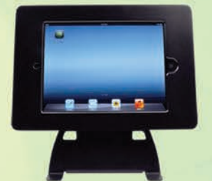
TM-IPD Landscape Position