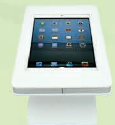
Enclosure can tilt from 15° to 60°