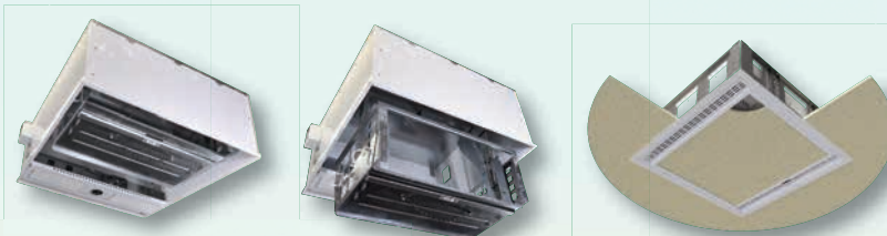
CB-224 closed CB-224 open Shown with CB-22 Patent 9,966,752