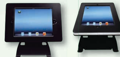
NEW! iPad mini