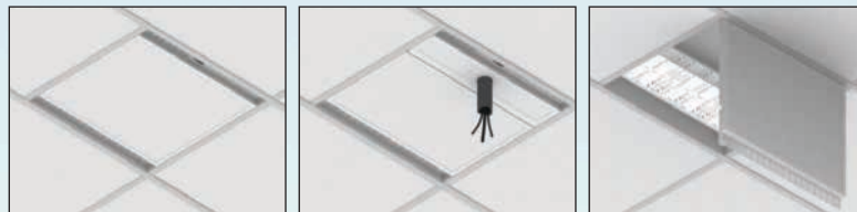
CB-22 closed CB-22 closed with pole CB-22 open