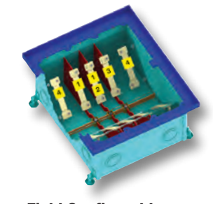
Field Configurable Interior