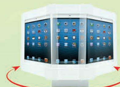
Enclosure can Swivel 90° Left and Right