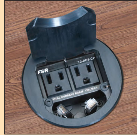
T3-AC2CP Shown with round cover in black.

The T3-AC2 primarily allows quick, convenient access to AC power and network access for up to two computers or laptops.