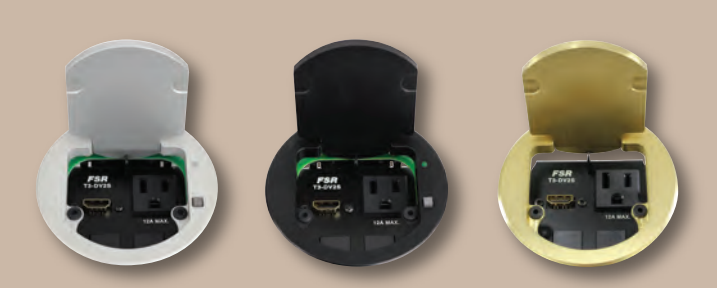
T3-DV2S US Patent # D553,306 S

The T3-DV2S is HD ready with a bulkhead mounted HDMI connector and two keystone openings for FSR's snap-in USB charger (other connectors optional). An AC outlet with cord is included to power a laptop or mobile device. Optional one or two push button LED is available to operate and provide status from control systems. Easily wired output using captive screw terminals. Round or square cover choice, in aluminum, black or brass finishes.