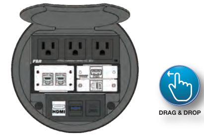
TABLE BOX CONFIGURATOR

Use our online drag and drop configurator tool to customize your Table Boxes.