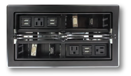
Cable Retractors work flawlessly with our Unity Collection of Table Boxes.

FSR's cable retractors offer convenience as well as cable storage and protection, hiding unsightly cables when not in use. The cables can be quickly deployed by the user and extend up to four feet. A simple pull and release of the extended cable is all that is needed to return the cable to the reel. No button release is required. The retractors can also be mounted in a horizontal position under a table surface to maximize space and provide clearance for seating.