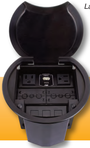
T6-LB-AC2CH-CC and Retractors