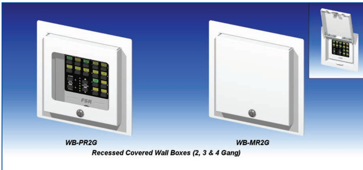
WB-PR2G WB-MR2G Recessed Covered Wall Boxes (2, 3 & 4 Gang)

The Wall Box series offers 18 different models to fit your needs. Everything from recessed to surface mounts are available for new or existing construction. We have addressed the rising issue of network security with models featuring a locking metal door, available with or without a clear acrylic window in models with two or more gangs. The window can be used as a view port, allowing the operator to effortlessly monitor the status of the control panel mounted in the box without opening it. The WB Series is an effective way to secure and protect wall plates and data plates with multiple network connections. They may also be used to mount other touch plates.