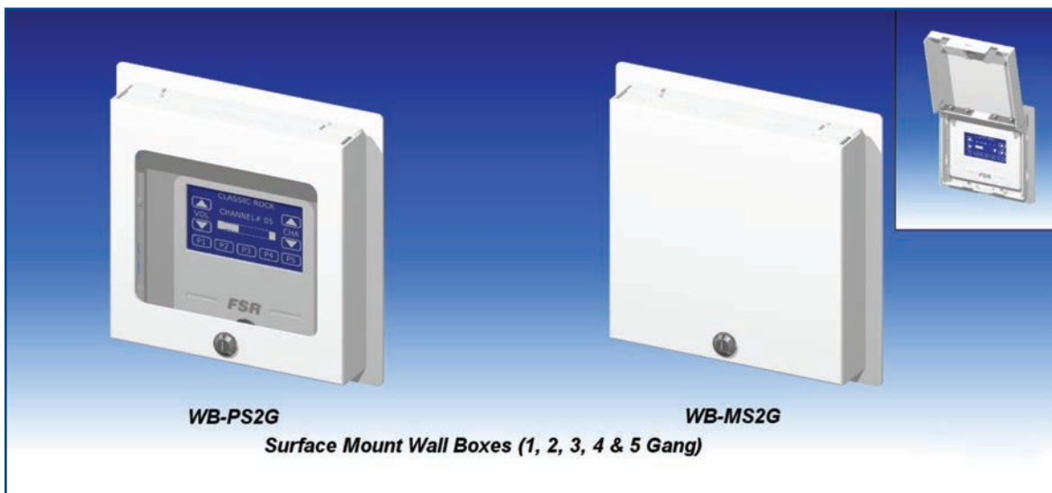
WB-PS2G WB-MS2G Surface Mount Wall Boxes (1, 2, 3, 4 & 5 Gang)