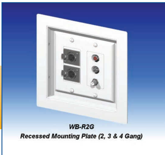
WB-R2G Recessed Mounting Plate (2, 3 & 4 Gang)

The Wall Box series offers 18 different models to fit your needs. Everything from recessed to surface mounts are available for new or existing construction. We have addressed the rising issue of network security with models featuring a locking metal door, available with or without a clear acrylic window in models with two or more gangs. The window can be used as a view port, allowing the operator to effortlessly monitor the status of the control panel mounted in the box without opening it. The WB Series is an effective way to secure and protect wall plates and data plates with multiple network connections. They may also be used to mount other touch plates.