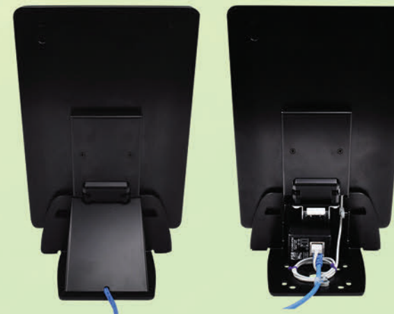
Enclosure Shown with Back Cover in Place and Open to show PoE to USB Charger