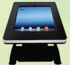
Enclosure can tilt from 15° to 60°