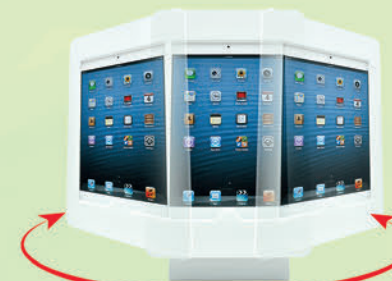
Enclosure can Swivel 90° Left and Right