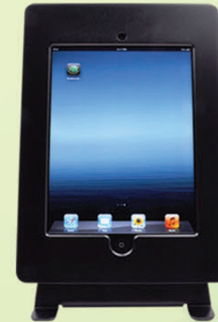
TM-IPD Portrait Position