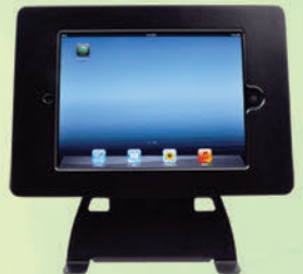
TM-IPD Landscape Position