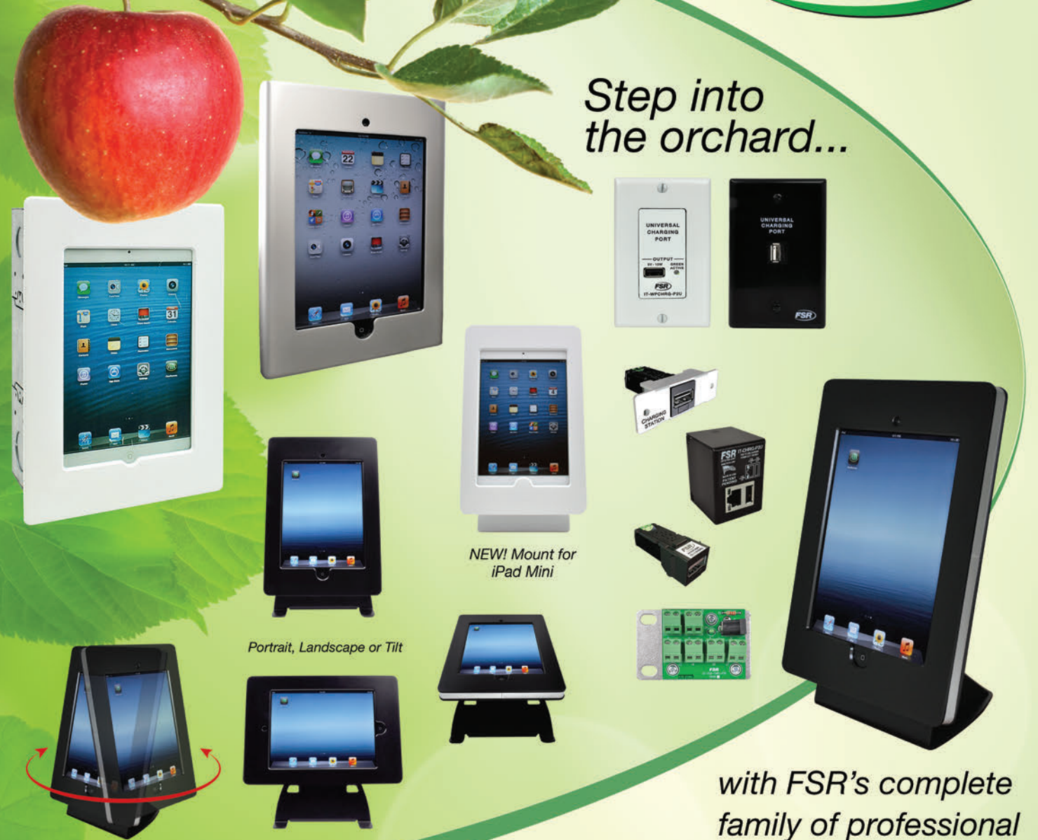
NEW! Mount for iPad Mini