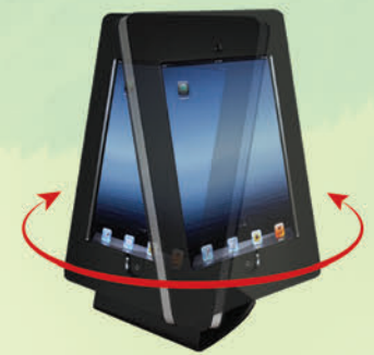
Swivel version Enclosure can Swivel 90° Left and Right