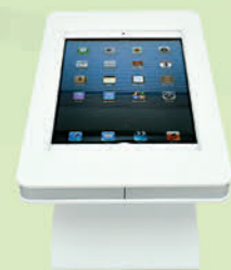
Enclosure can tilt from 15° to 60°