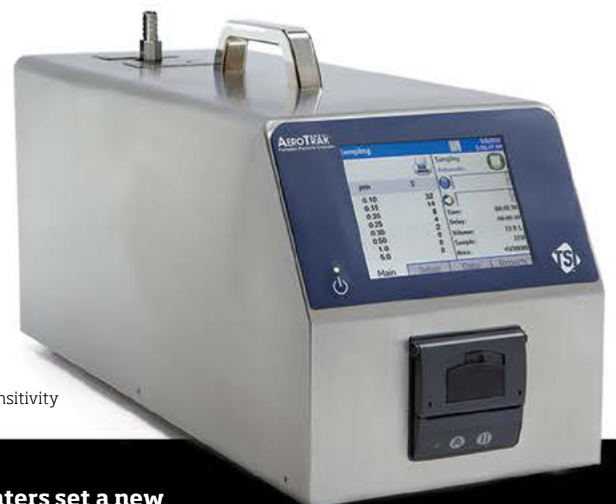
Model 9110 0.100 \mu\text{m} Sensitivity

AeroTrak Portable Particle Counters set a new standard for your everyday certification needs.