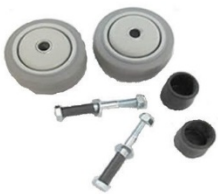
Wheel Kit P/N SWA-05