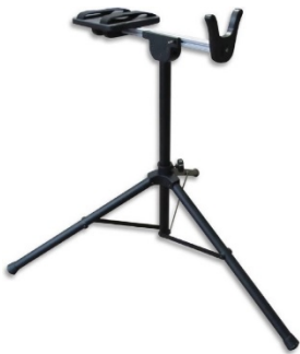
Fiber Enclosure Tripod Stand P/N: ETS-63