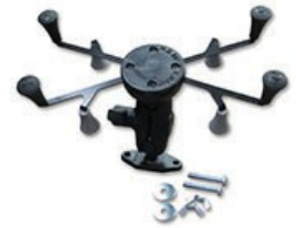
Splice Tray Holder P/N: SWA-04