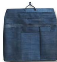
Black Poly-Mesh 3-Pocket Pouch P/N: SWA-07