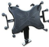
Tablet Holder P/N SWA-02