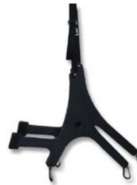
Stand-Offs P/N SWA-03