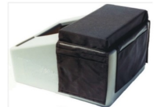
Tool Saddle with Pocket P/N SWA-08