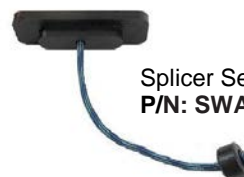
Splicer Seat Tether P/N: SWA-10