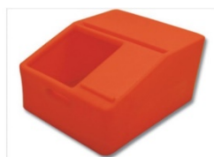
Splicer Seat P/N: SWA-09