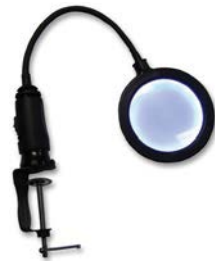
LED Dual Power Light with Magnifying Glass P/N SWA-06