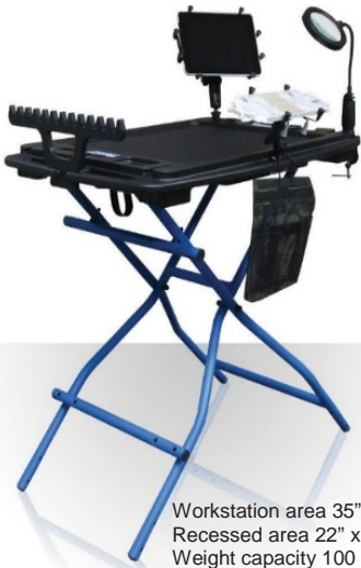
Workstation area 35" x 22" Recessed area 22" x 18" Weight capacity 100 lbs