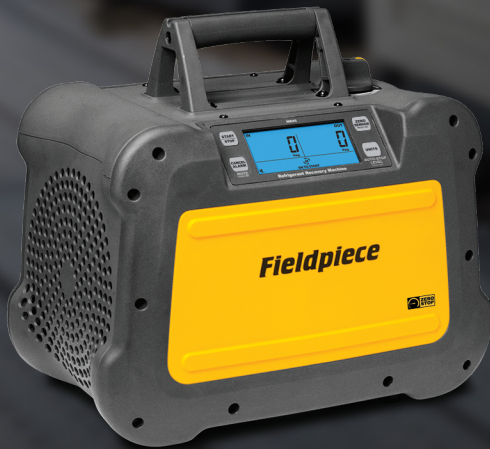
Recovery Machine MR45