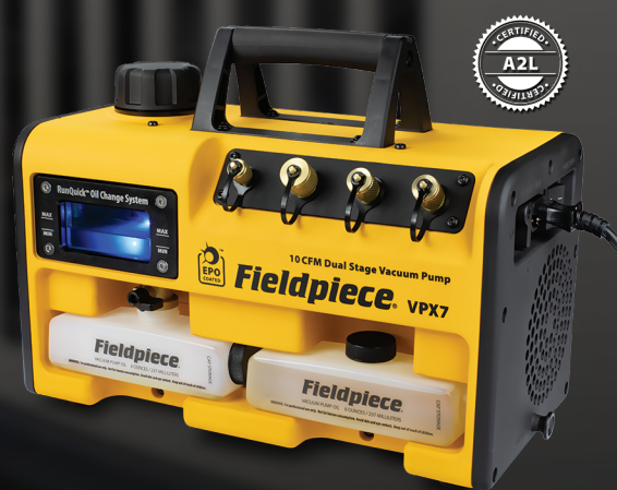
Vacuum Pumps VPX7, VP87, VP67