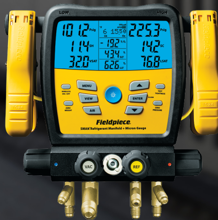
Refrigerant Manifolds SM480V, SM380V