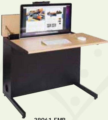
38961 FMB 36" Flex InSight Desk ADA compliant knee space is 30"W x 19"D x 28"H