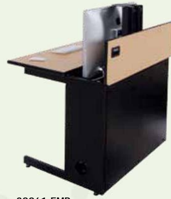
38961 FMB 36" Flex InSight Desk Exclusive VESA compliant monitor mount provides pan and tilt for optimal viewing angles