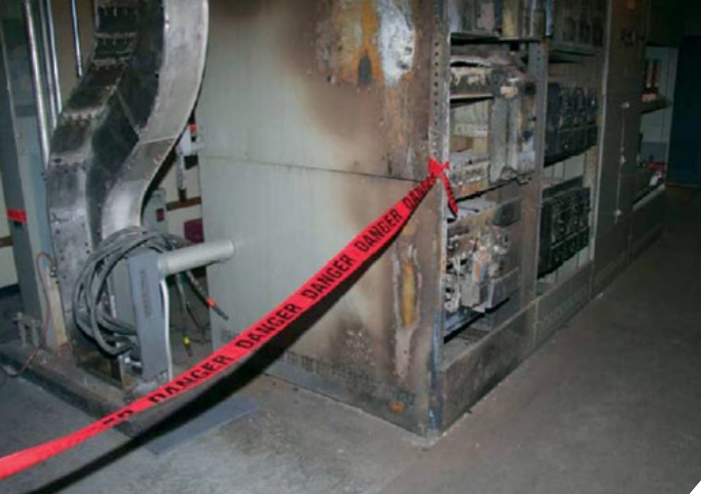
Figure 2. Switchgear fire that resulted in €2.3 million in damage. This facility declined an IR survey offer by a CNA thermographer just months before the fire happened.

had IR scans have saved more than €11 million per year.