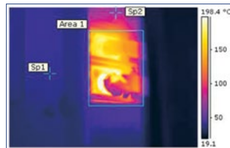
Figure 3. IR image showing a critical thermal fault on an electrical conductor at a fruit processing plant.

CNA Insurance uses the average electrical loss of €648,000 or the specific loss by type (circuit breakers, switchgear, or MCC rooms) for critical and serious faults discovered during the IR survey. If the fault is found on specialized equipment, they use specific replacement-cost information for the type or piece of equipment. Operating equipment until failure not only results in costly repairs, but can also prevent a facility from producing products, or may