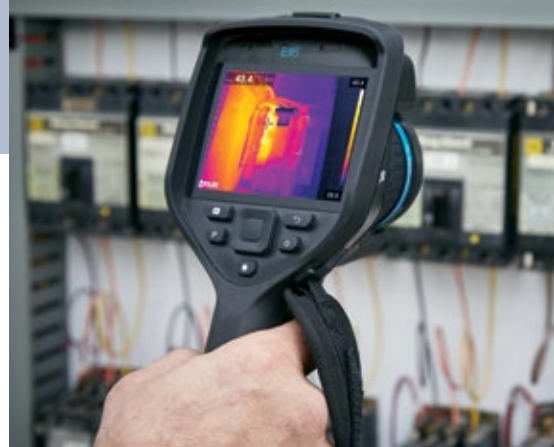
Figure 1. FLIR E95 Professional Thermal Camera

Thermal imaging cameras detect heat that is emitted from faulty equipment in the form of infrared energy. Everything with a temperature above absolute zero releases