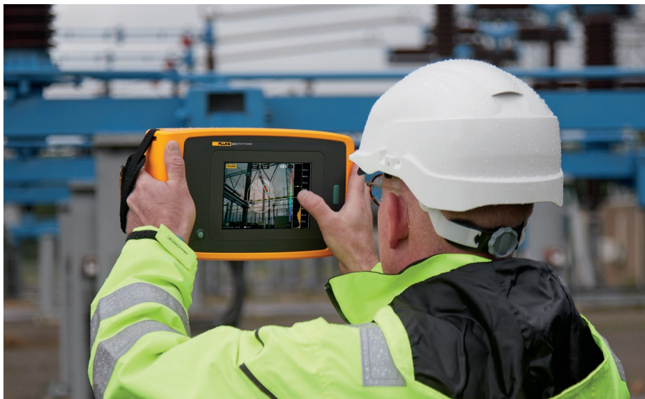
Image taken of the ii910 Precision Acoustic Imager detecting partial discharge in a high voltage application.