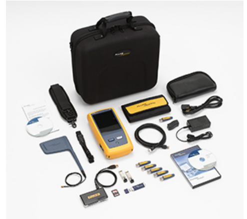
Figure 1: OneTouch™ AT / ClearSight™ Troubleshooting and Analysis Kit

While simple to use, the OneTouch AT provides sophisticated functionality not found in basic taps. Power over Ethernet is not only passed through, but is measured in real time. It supports both copper and fiber, without external transceivers. Full-duplex capture is supported, which would otherwise require an aggregating tap with buffering.