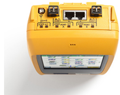
Figure 2: OneTouch™ AT connection ports