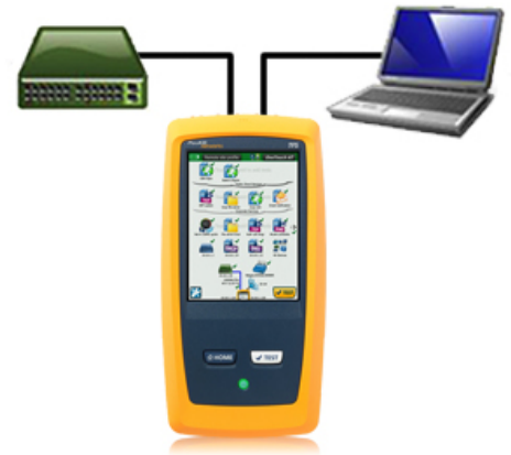
Figure 3: OneTouch™ sample of inline connections

The award-winning ClearSight Analyzer (CSA) offers advanced application-centric monitoring and performance analysis, enabling enterprise Network Administrators and Engineers to maintain, diagnose, and resolve application and network performance issues in multi-protocol network environments. The ClearSight application analyzer supports the most commonly used protocols – both wired and Wi-Fi, and users can import Wireshark™ decodes to take advantage of the open-source community – making the ClearSight application analyzer the most versatile protocol analyzer in the market.