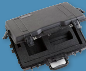
Probe and Readout Case