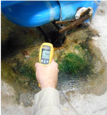
Taking the temperature of condensate as it goes into the drain.

It is absolutely critical that products in coolers and freezers are maintained at the correct temperature. The Fluke 64 MAX IR Thermometer can quickly show that the products in a cooler or freezer are stored under the proper conditions. Since you can point the Fluke 64 MAX IR Thermometer at any products in the refrigerated space, it is superior to simple fixed location thermometers. And at the same time you check the product temperatures, you can check the evaporator coil and discharge air temperatures as well.