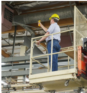
Identifying the temperature of ceiling-mount equipment.

Almost all commercial air handling units provide a low temperature limit switch. To prevent the freeze-up of a water coil, the low temperature limit will stop the supply fan. In some cases the low temperature limit may be adjusted incorrectly. You can use the Fluke 64 MAX IR Thermometer to check the calibration of the low temperature limit and adjust as needed.