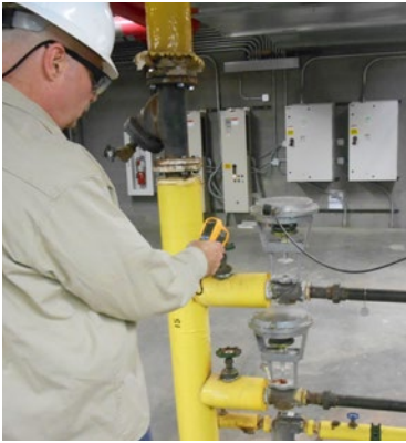
Measuring the steam temperature at the inlet to the humidifier valve.