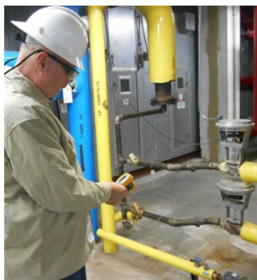
Testing the steam trap to see whether the trap has failed open and is wasting steam.