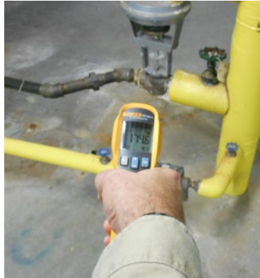
Viewing the temperature of the condensate line from a steam trap, to make sure it is functioning properly.

Steam trap failure can waste energy and cause improper HVAC system operation, resulting in a system freeze-up. With the Fluke 64 MAX IR Thermometer you can quickly identify a steam trap that has failed either open or closed.