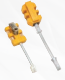
4 and 8 position Modular Adapters