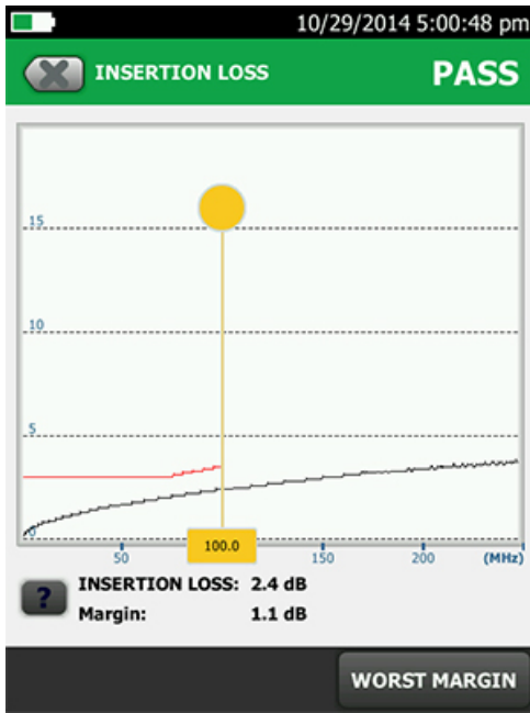
Figure 1. Measured Insertion Loss and limit for 100 foot Type 734 cable.