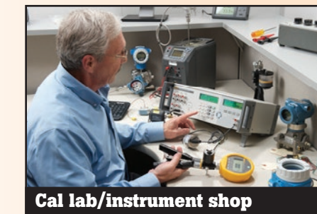
Cal lab/instrument shop