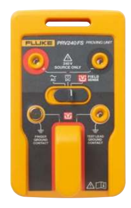
Fluke PRV240 FS