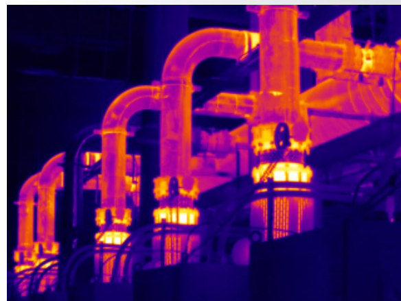
MultiSharp Focus, available on the RSE300 and RSE600 Infrared Cameras