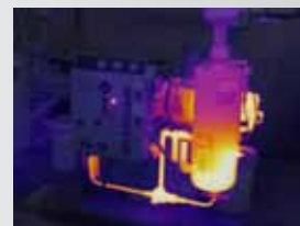
75 % blending