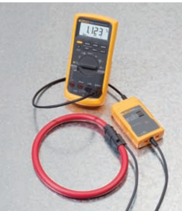
i2000 Flex connected to a Fluke 87V Digital Multimeter.

Fluke. Keeping your world up and running.™