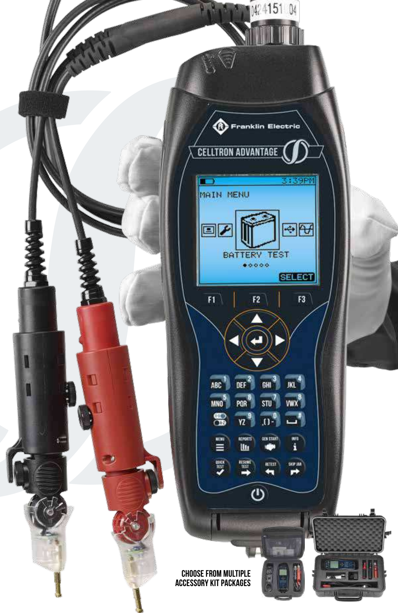
CHOOSE FROM MULTIPLE ACCESSORY KIT PACKAGES

The CELLTRON Advantage's conductance-based testing approach requires minimal battery discharge.