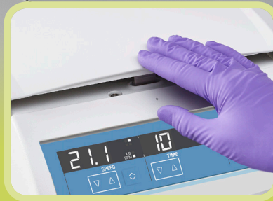
Fast one-click centrifuge lid closure