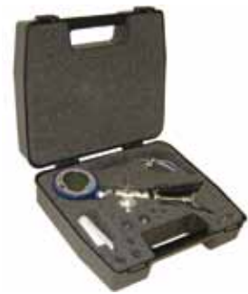
Pneumatic test kit