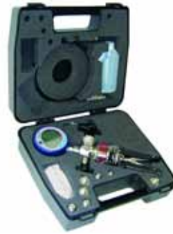
Hydraulic test kit

Includes: DPI 104; ranges to 15,000 psi (1000 bar), PV 212 hydraulic test pump, hose, adaptors, seal kit and case.