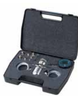
Low pressure pneumatic test kit

Includes: DPI 104; ranges to 30 psi (2 bar), PV 210 low pressure pneumatic test pump, hose, adaptors, seal kit and case.