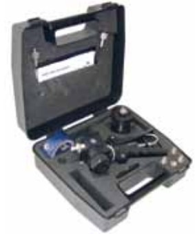
Pneumatic and hydraulic test kit