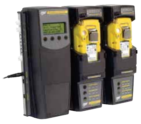
MicroDock II Automatic test and calibration station (see MicroDock II section for additional information)