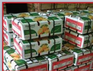
Monitor a climate-controlled food warehouse