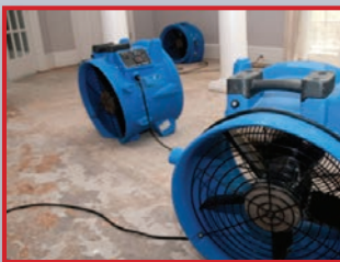
Monitor the drying part of water damage restoration