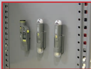
Magnetic back for easy storage and deployment