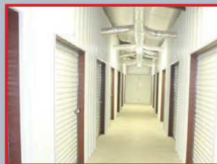
Monitor storage facility temperature and humidity