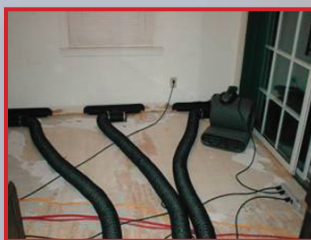
Monitor water damage restoration