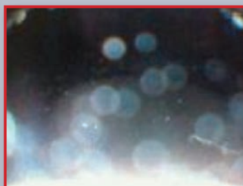
Before pressing anti-reflection button (with mirror)