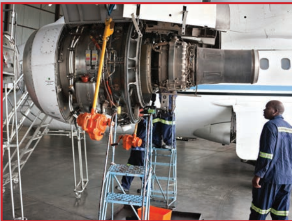
An articulating probe is a must for inspecting densely packed aircraft engines

Compatible with General's DCS1600, DCS1600ART and DCS1800 high-performance video borescope inspection systems, H16 handheld recording console and DCS1800-TR wireless probe handle/controller