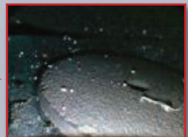
After pressing anti-reflection button (with mirror)