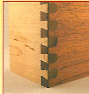
Cuts Through Joints