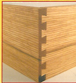
Cuts Half-Blind Joints

Includes: 1/2" Dovetail Router bit, User's Manual