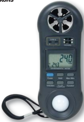
DLAF8000 DLAF8000C N