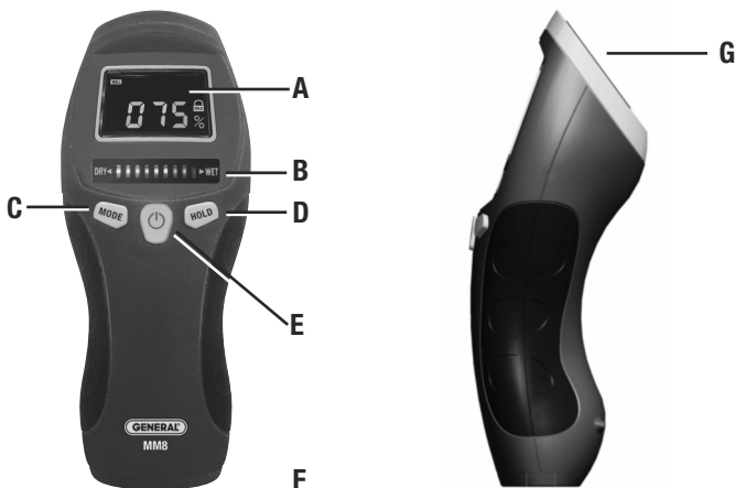
Fig. 1. The controls, indicators and physical features of the MM8

Fig. 1 shows all of the controls, indicators and physical features of the MM8. Fig. 2 shows all possible display indications. Familiarize yourself with the position and function of all components before moving on to the Setup Instructions.