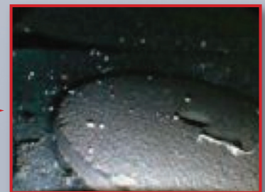
After pressing anti-reflection button (with mirror)

The anti-glare function of a VGA resolution probe