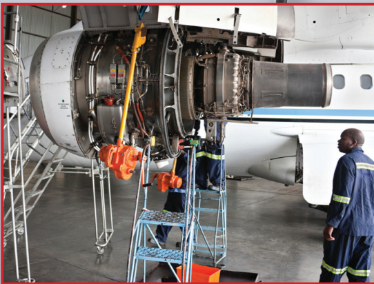
An articulating probe is a must for inspecting densely packed aircraft engines

Compatible with General's DCS1600, DCS1600ART and DCS1800 high-performance video borescope inspection systems, H16 handheld recording console and DCS1800-TR wireless probe handle/controller