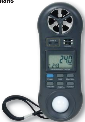
DLAF8000 DAF8000C N