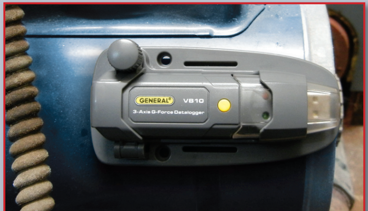
The VB10 logging the vibration of a small motor