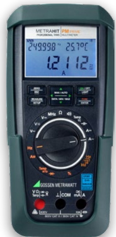
METRAHIT PM PRIME