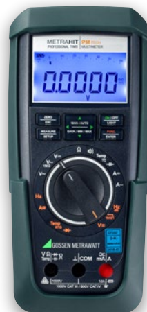
METRAHIT PM TECH