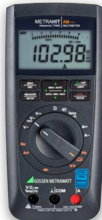
METRAHIT AM PRO