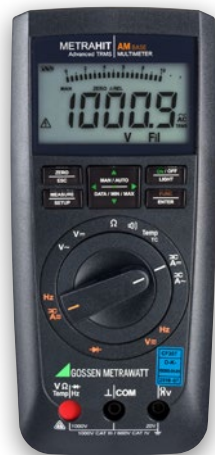
METRAHIT AM BASE

Safe and Reliable Multimeters for Diverse Applications