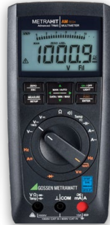
METRAHIT AM TECH