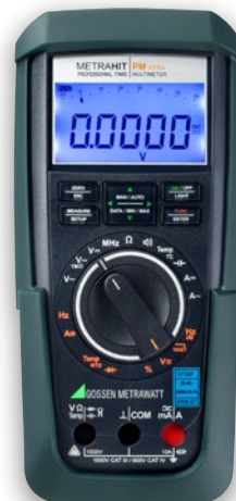
METRAHIT PM XTRA