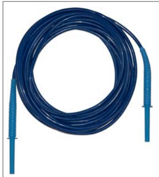
Measurement lead MCABLE-10m-blue (Z555R)